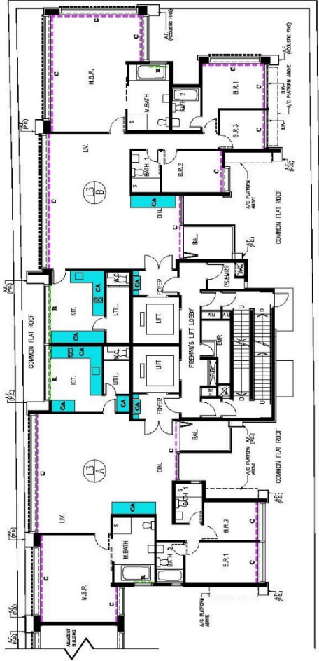
Floor Plan 樓面平面圖 (For Identification Purpose Only) (只作辨識用途)